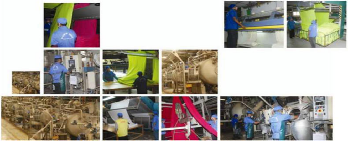
Altogether, Robintex's dyeing facility results in a clone-like perfection.